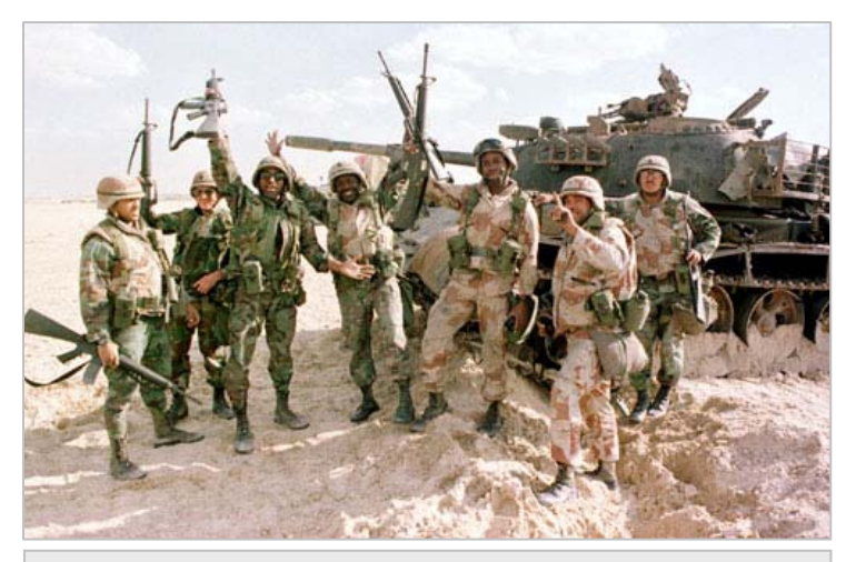
American soldiers cheer beside a destroyed Iraqi tank in Kuwait during Operation Desert Storm in 1991

Following is another excerpt from Jim Baker's book, The Politics of Diplomacy: Revolution, War and Peace, 1989-1992 , explaining that the defeat of Saddam Hussein's Iraq in the 1991 Gulf War led to the restarting of the Middle East peace process: