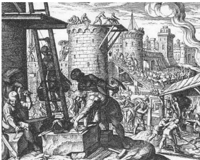
Rebuilding the City

Key Understanding: Rebuilding the city, the wall, and the temple. With this series begins a more in-depth understanding of the (re)building of Israel. When Jerusalem and Judah were (re)built in the time of the rule of Media-Persia, the rebuilding focused on (i) the City (of Jerusalem), (ii) the Wall (of Jerusalem), and (iii) the Temple (at Jerusalem).