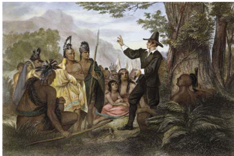
John Eliot, Puritan missionary to Native Americans, preaches to Indians in the Massachusetts Bay Colony

Key Understanding #2: The Canaanite American Indians. In the story of the deceived Puritans building America as an earthly New Israel for the New Testament Church, the Lord's prophetic role for the American Indians was that of being Canaanites in the land of America.