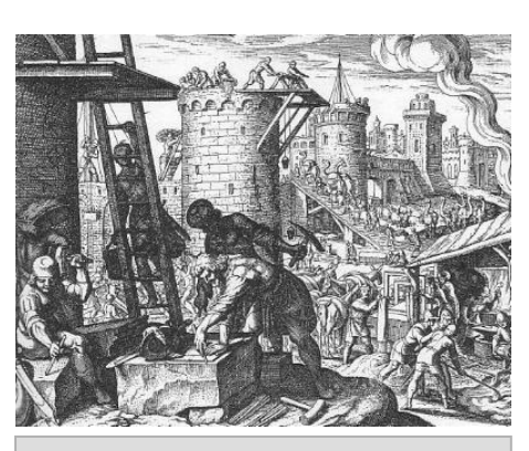
Rebuilding the City

Review: The City, the Wall, the Temple. When Jerusalem and Judah were (re)built in the time of the rule of Media-Persia, the rebuilding focused on (i) the City (of Jerusalem), (ii) the Wall (of Jerusalem), and (iii) the Temple (at Jerusalem). Our initial focus has been on the City. Our new focus will be on the Wall.