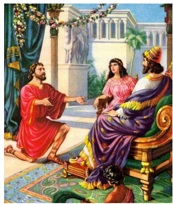
Nehemiah pleads for Jerusalem

8 And a letter unto Asaph the keeper of the king's forest, that he may give me timber to make beams for the gates of the palace which appertained to the house, and for <u>THE WALL</u> <u>of the city</u>, and for the house that I shall enter into. And the king granted me, according to the good hand of my God upon me.