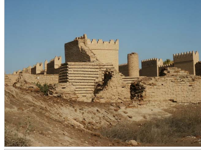
Some of the original walls of ancient Babylon

48 Then the heaven and the earth, and all that is therein, shall sing for Babylon: for the