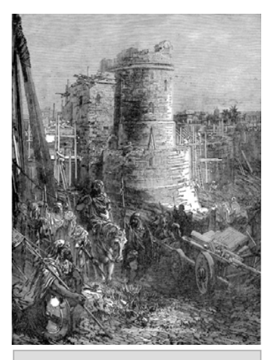
Rebuilding the Wall