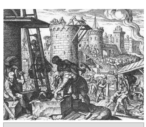
Rebuilding the City

Key Understanding: Now we turn our attention to the (re)building of the Temple(s).