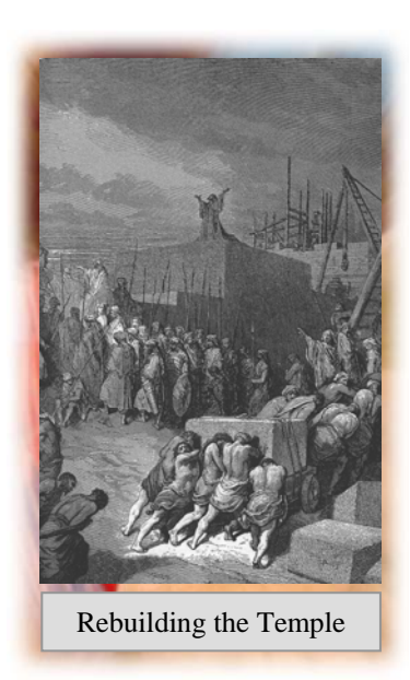
2 Corinthians 6:16-18 (KJV) And what agreement hath THE TEMPLE OF GOD with idols? FOR YE ARE THE TEMPLE OF THE LIVING GOD; as God hath said, I will dwell in them, and walk in them; and I will be their God, and they shall be my people.