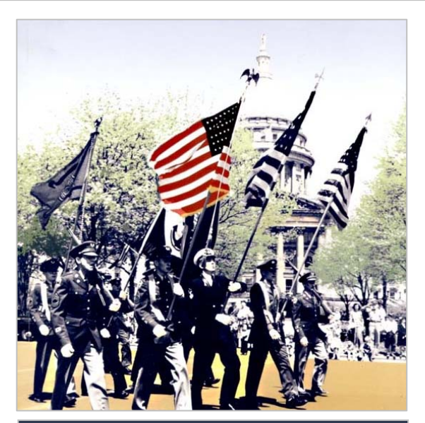
The 'Body of Americans' has prophetically represented the entity of the Lord's Holy Nation/Holy Temple Gentile Christian New Israel

Said yet another way, neither the Christian New Israel (the Body of Americans) nor the Jewish new Israel (the Body of Israelis) is led by the Spirit of the living God.