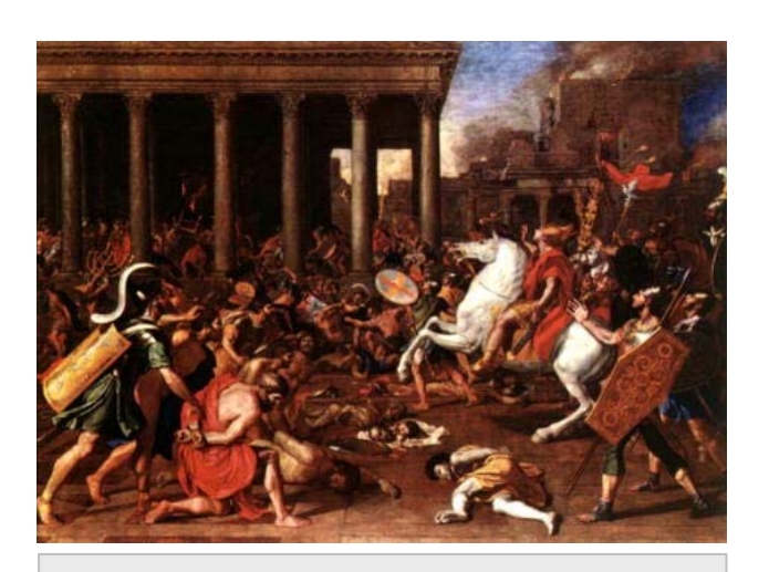
The destruction of the Temple in Jerusalem by Roman soldiers in A.D. 70

would be building a new Temple – a Temple of living stone believers in the New Testament age.