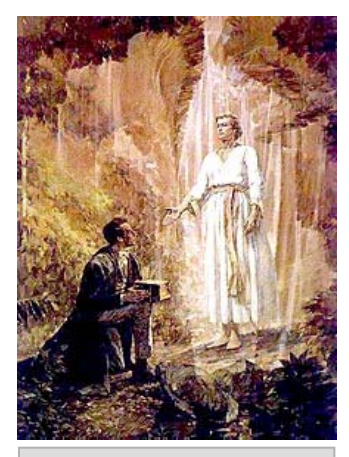
Depiction of the Angel "Moroni" revealing to Joseph Smith the golden plates of the Book of Mormon

Immediately below is an article from another source about the founding of The Church of Jesus Christ of Latter-day Saints and the role of Independence, Missouri, as the site of New Jerusalem.