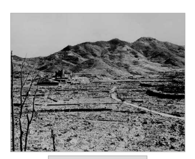
The aftermath of Nagasaki

Here is #488-Doc 1, about a book titled Rain of Ruin: A Photographic History of Hiroshima and Nagasaki.