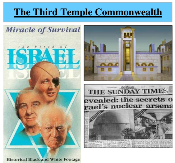
Matthew 24:15 (KJV) When ye therefore shall see THE ABOMINATION OF DESOLATION [in conjunction with the Third Temple being constructed through the joining together of the Man o' War 'Living Stones' Christian New Israel (the Body of Americans as the Third Temple) and (with) the Man o' War 'Living Stones' Jewish new Israel (the Body of Israelis as the Third Temple)], spoken of by Daniel the prophet, stand in the holy place, (whoso readeth, let him understand:)