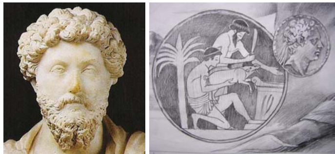
Antiochus IV Epiphanes

31 “ HIS ARMED FORCES WILL RISE UP TO DESECRATE THE [Second, or Zerubbabel’s] TEMPLE FORTRESS AND WILL ABOLISH THE DAILY SACRIFICE. Then they will set up THE ABOMINATION OF DESOLATION.