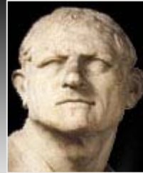
Lysimachus ruled Thrace

23 And in the latter time of their kingdom, when the transgressors are come to the full, a king of fierce countenance, and understanding dark sentences, shall stand up.