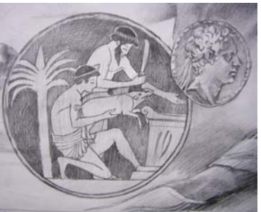
Antiochus IV Epiphanes