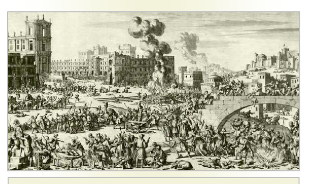
A 1690 copper engraving of Antiochus IV Epiphanes's destruction of Jerusalem and ransacking of the Temple in 167 B.C.