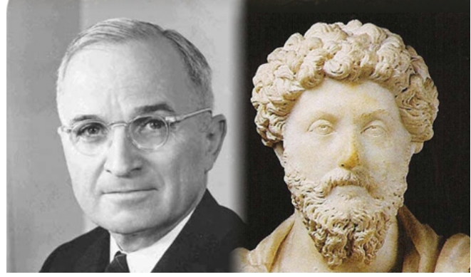
#1608 The Yom Kippur War and the Abomination of Desolation – The United States of America is in prophecy as the second (but counterfeit ) Media-Persia building the Third Temple, but is actually the second (and true ) Syria desecrating and destroying the Third Temple