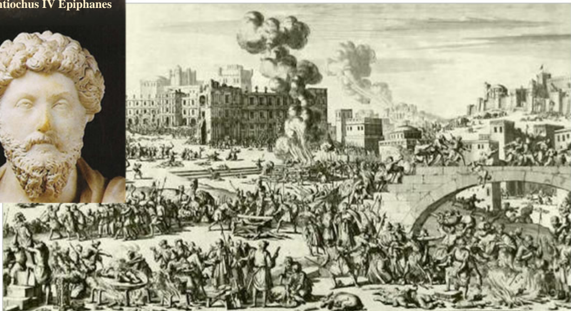
A 1690 copper engraving of Antiochus IV Epiphanes's destruction of Jerusalem and ransacking of the Temple in 167 B.C.