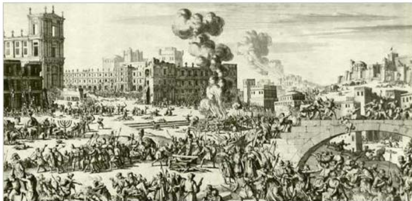
A 1690 copper engraving of Antiochus IV Epiphanes’s destruction of Jerusalem and ransacking of the Temple in 167 B.C.

The former day(s) of Daniel 8:9: Antiochus III the Great and Antiochus IV Epiphanes of the Syrian Seleucid Empire fulfilled Daniel 8:9