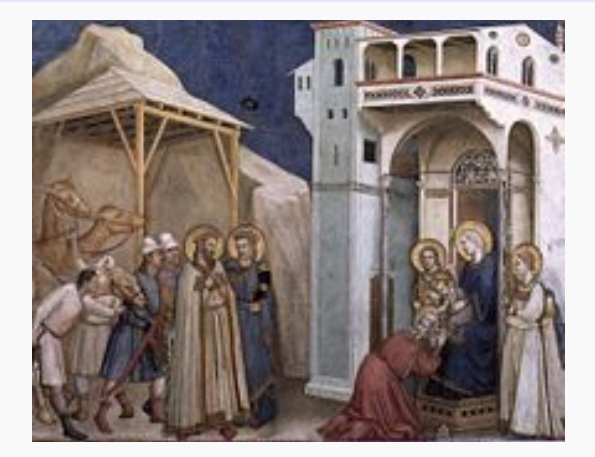
The Adoration of the Magi. Fresco in Lower Church, Basilica of San Francesco d'Assisi