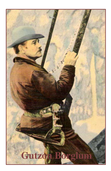
Key Understanding: 1941 birth and 1941 completion. As further evidence of the prophetic link between the Four Freedoms and Mount Rushmore with its Four Presidents, the <u>Four Freedoms</u> were <u>birthed</u> in 1941, and Mount Rushmore with its <u>Four</u> <u>Presidents</u> was <u>completed</u> later that same year by Lincoln Borglum, with the completion revolving around the death of Gutzon Borglum on March 6, 1941.

#1628 The Yom Kippur War and the Abomination of Desolation – The series of 4's (fours) leading up to and surrounding the latter day(s) fulfillment of Daniel 8:9 through Harry Truman and the Atomic Bomb, part 2e, Mount Rushmore with its Four Presidents: 1941: The Four Freedoms were birthed in 1941, and Mount Rushmore with its Four Presidents was completed that same year, with its completion revolving around the death of Gutzon Borglum on March 6, 1941