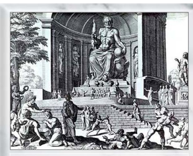
The Abomination of Desolation <u>sculpture</u> of the former day(s) was tied to Zeus and Antiochus IV Epiphanes. [Note: The above depiction is <u>not</u> of the statue of Zeus in the Jerusalem Temple. It is rather "a fanciful reconstruction of Phidias' statue of Zeus at Olympia, Greece, one of the original Seven Wonders of the Ancient World, in an engraving made by Philippe Galle in 1572, from a drawing by Maarten van Heemskerck."]

Key Understanding: The sculptures . The Abomination of Desolation of the former day(s) fulfillment of Daniel 8:9-12 surrounded the <u>sculpture</u> of Zeus in the likeness of Antiochus IV <u>Epiphanes</u>, while the Abomination of Desolation in the latter day(s) fulfillment of Daniel 8:9-12 surrounds the monumental <u>sculptured</u> faces of the Four Presidents of Mount Rushmore, which are tied prophetically to the Four Freedoms of <u>Epiphany</u>, January 6, 1941.