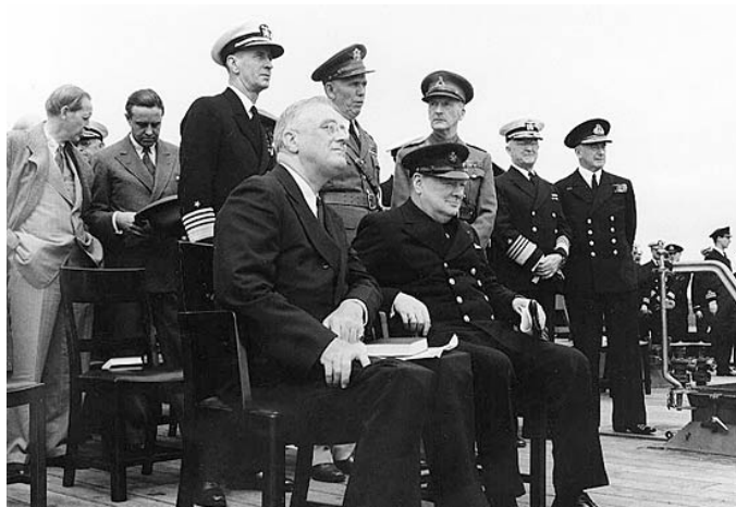
Franklin D. Roosevelt and Winston Churchill on board HMS Prince of Wales during the Atlantic Charter conference, 1941

Key Understanding: The four years from the Atlantic Charter to the atomic bomb. It is now time to concentrate on the prophecy surrounding part 4 below, which is about the Four Years from the August 9, 1941, first day of Roosevelt and Churchill’s 4-day (four-day) Atlantic Charter conference to the August 9, 1945, atomic bomb.