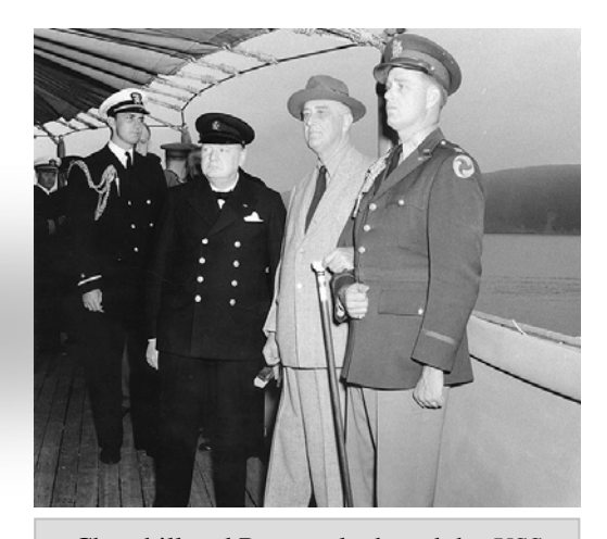
Churchill and Roosevelt aboard the USS Augusta at the August 9-12, 1941, Atlantic Conference, which resulted in the August 14, 1941, Atlantic Charter

Key Understanding: The Four Freedoms and the Atlantic Charter . The January 6, 1941, <u>Four Freedoms</u> were purposely and substantially incorporated into the August 14, 1941, <u>Atlantic Charter</u>.