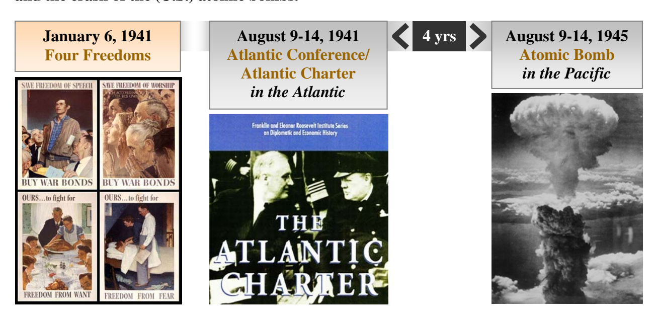
#1658 The Yom Kippur War and the Abomination of Desolation – The series of 4's (fours) leading up to and Page 1 of 2 surrounding the latter day(s) fulfillment of Daniel 8:9 through Harry Truman and the Atomic Bomb, part 4f, The Four Years from the Atlantic Charter to the Atomic Bomb: The Lord ordained Roosevelt's Four Freedoms words of "with the crash of a (Nazi) bomb" to point to the prophetic relationship between the Four Freedoms and the crash of the (U.S.) atomic bombs

Key Understanding: The Lord ordained Roosevelt's Four Freedoms' words of "with the crash of a (Nazi) bomb" to point to the prophetic relationship between the Four Freedoms and the crash of the (U.S.) atomic bombs.