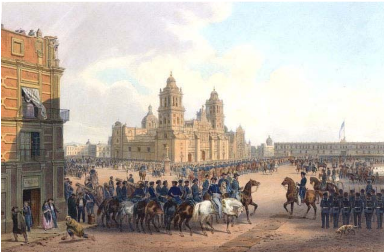
The fall of Mexico City during the Mexican-American War

Mexico had gained its independence from Spain in 1821. The map on page 1, on the right , shows the Mexican Cession of what had once been the land of New Spain to the United States under the terms of the Treaty of Guadalupe Hidalgo that ended the Mexican War in 1848.