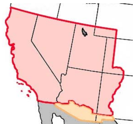
Lands ceded to the U.S. in the wake of the Mexican-American War (outlined in red) and the Gadsden purchase (yellow)

in the age of Theodore Roosevelt was the 1846-1848 War with Mexico, which finalized the fulfillment of Daniel 7:8 in the sense of completing the uprooting of the third of the three horns, Mexico, which had uprooted Spain in 1821. Again, the Mexican War moved the United States from its fulfillment of Daniel 7:8 toward its fulfillment of Daniel 8:9.