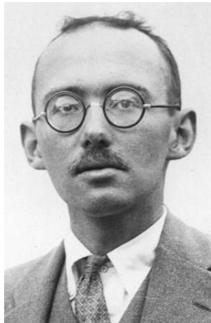
Stephen Vincent Benet

Western Star . When Stephen Vincent Benet died at the age of 44 on March 13, 1943, the very date of the edition of the Saturday Evening Post that contained his essay on Freedom from Fear, he was in the beginning