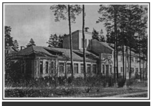
Residence of the German rocket team in the village of Mamontovka near Moscow circa 1947

Key Understanding (of Unsealing #124): The mixture of Germany, the U.S., and the USSR in the space race. The same three nations of Germany, the United States, and the Soviet Union that are seen in the prophetic outworking of Daniel 2:41-43, because of the combination of World War II and the Cold War, are also seen in Revelation 17:10-11, through the Space Race. The point is that the Lord emphasized