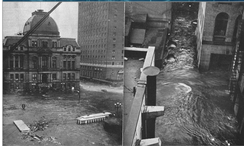
Flooding in Providence, Rhode Island, due to the hurricane of September 21, 1938