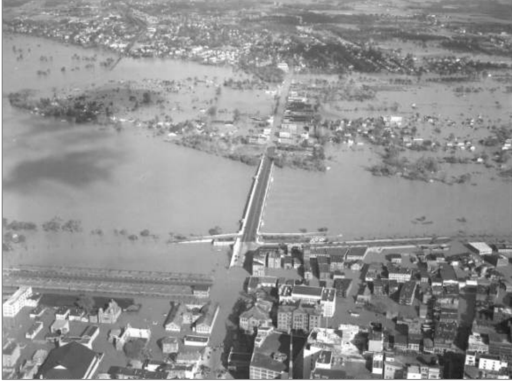
Hartford and East Hartford, Connecticut, after the hurricane of September 21, 1938