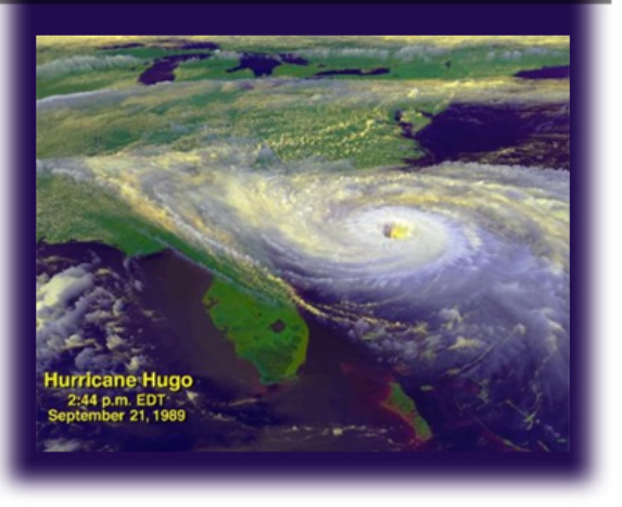
#1801 The Yom Kippur War and the Abomination of Desolation – The post-World War II U.S. waxing great Page 1 of 2 toward the South and toward the East as a second Syria/Antiochus IV Epiphanes, part 60, Irving Berlin and God Bless America : The autumnal equinox Hurricanes of September 21-22, 1938, and September 21-22, 1989, pointed to the eventual fall of Nazi Germany in World War II and fall of the Soviet Union in the Cold War, respectively