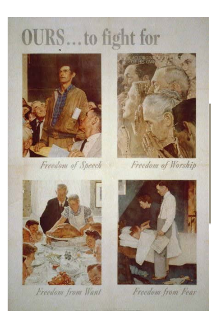
A poster ( left ) depicting the "Four Freedoms," one of which is "Freedom of Worship" ( right ), from President Roosevelt's famous speech of January 6, 1941

Key Understanding: The subtle deception of "religious freedom. " One of the most subtle deceptions in the battle between the Cross of Jesus Christ and the Rights of Man is that of "religious freedom." The very words "religious freedom" should not be confused with the true spiritual freedom of the cross of Jesus Christ.