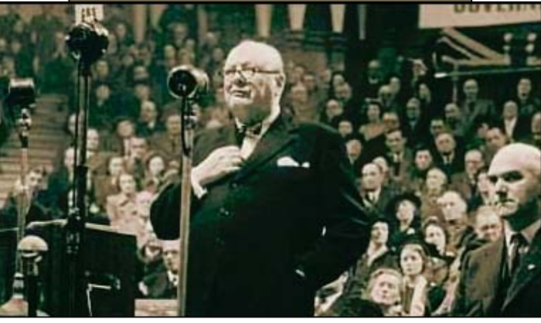
May 13, 1940, in the House of Commons

Winston Churchill Blood, Toil, Tears, and Sweat