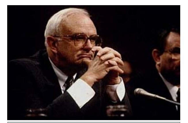
'Arms of silver' Les Aspin was born on <u>July 21, 1938</u>

Key Understanding: Les Aspin, chairman of the House Armed Services Committee during the time of the U.S. response to the August 2, 1990, invasion of Kuwait by Saddam Hussein's Iraq,