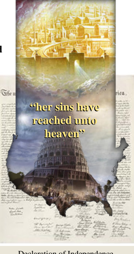
Declaration of Independence July 4, 1776

Key Understanding #2: Babylon's sins have reached unto heaven. The U.S. Declaration of Independence from Great Britain of July 2, 1776, as seen through the words of Samuel Adams, was fully possessed of the spirit of the counterfeit fulfillment of "Thy kingdom come," and "Thy will be done in earth, as it is in heaven" (Matthew 6:10), and as a consequence, simultaneously fulfilled Revelation 18:5, "For <u>HER</u> [Babylon's] <u>SINS</u>