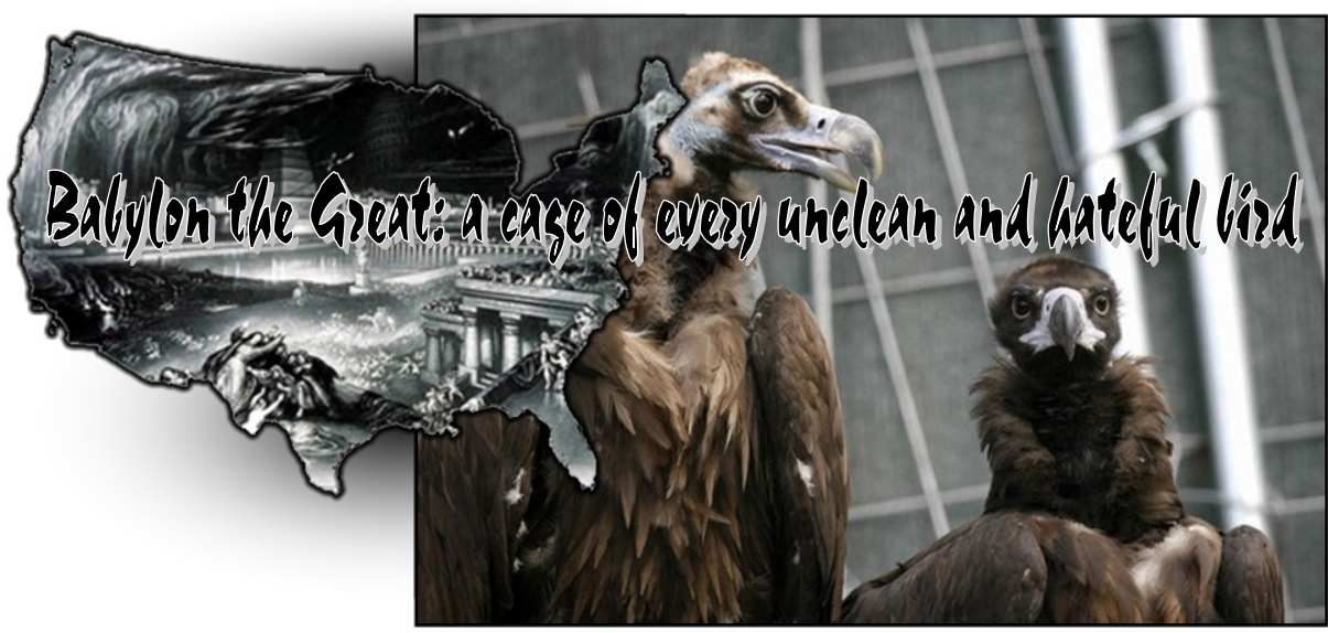
#1893 The Yom Kippur War and the Abomination of Desolation – The post-World War II U.S. waxing great Page 2 of 3 toward the South and toward the East as a second Syria/Antiochus IV Epiphanes, part 152, An Angel riding in the Whirlwind and directing the Storm: The Micah 5:5 Assyrian vs. the Micah 5:5 Seven Shepherds, (xxvi), Unclean Birds in a Cage: Sennacherib and Revelation 18:2, 5