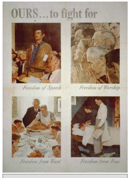
The Western Star

2 Saying, Where is he that is born King of the Jews? For we have seen his STAR IN THE EAST, and are come to worship him.