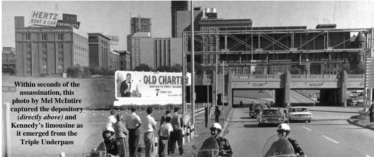
Within seconds of the assassination, this photo by Mel McIntire captured the depository (directly above) and Kennedy's limousine as it emerged from the Triple Underpass