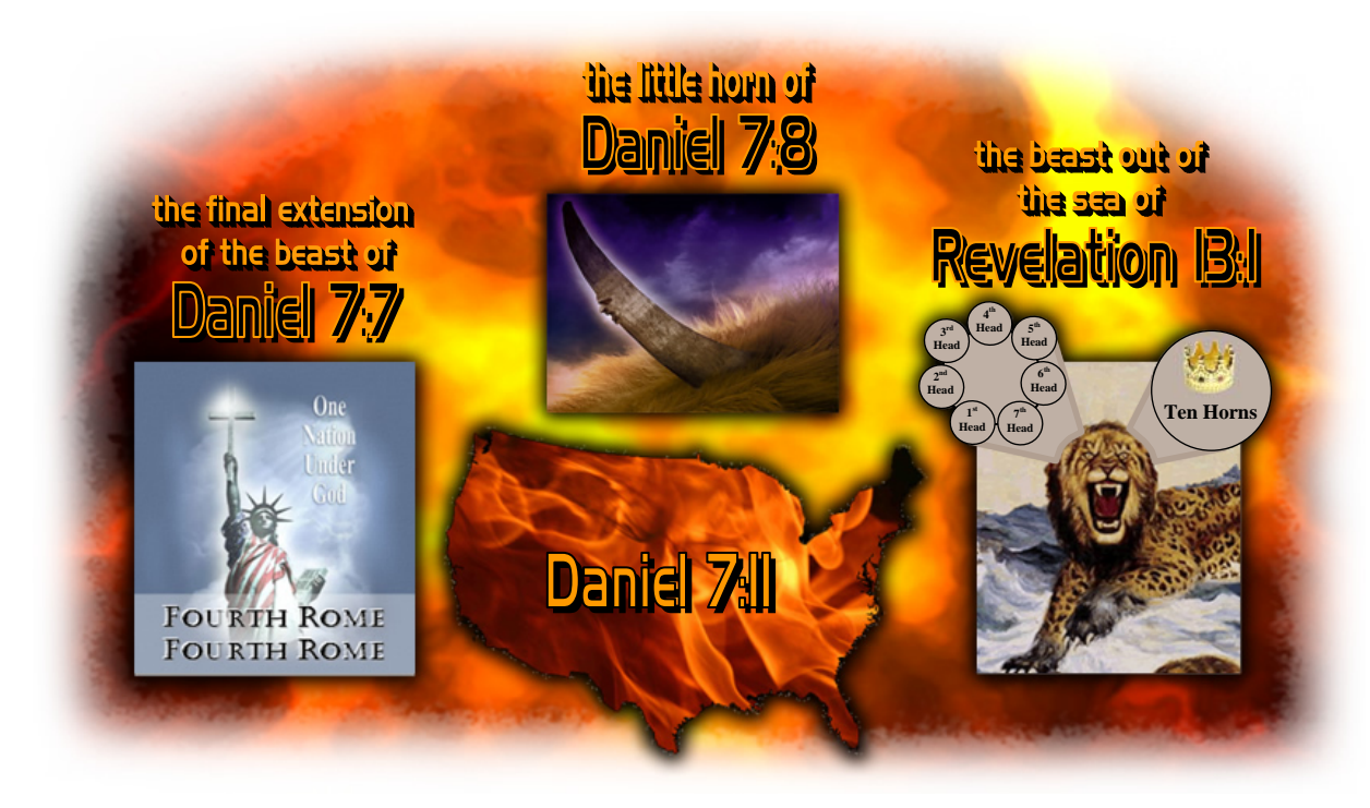
#1997 The Yom Kippur War and the Abomination of Desolation – The post-World War II U.S. waxing great Page 2 of 4 toward the South and toward the East as a second Syria/Antiochus IV Epiphanes, part 256, The House of Orange, (xxxiv), The Roman Beast that is given to the Burning Flame

Key Understanding #2: The United States as the Roman beast that is slain. Therefore, since the United States, as the Daniel 7:8 Little Horn, is the latter day(s) extension of the beast of Daniel 7:7, the Old Roman Empire, it can be seen that the identity of the beast that is slain, and that has his body destroyed, and that is given to the burning flame, is the United States of America, which thus wears the prophetic hats of (i) the final extension of the beast of Daniel 7:7, the Old Roman Empire, (ii) the Little Horn of Daniel 7:8, and (iii) the Beast out of the Sea of Revelation 13:1.