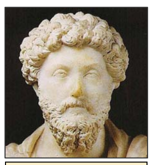
Antiochus IV Epiphanes