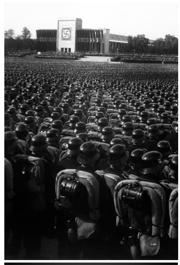
Overview of the mass roll call of SA, SS, and NSKK troops, Nuremberg, November 9, 1935

26 Then released he Barabbas unto them: and when he had scourged Jesus, he delivered him to be crucified.