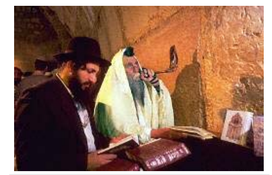
The blowing of the shofar at the wailing wall on the new moon of Tishri, in celebration of Rosh Hashanah, the Feast of Trumpets

Numbers 10:10 (KJV) Also in the day of your gladness, and in your solemn days, and in the beginnings of your months, ye shall blow with the trumpets over your burnt