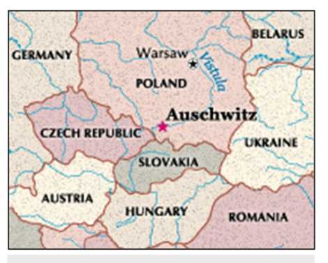
Modern day map of Europe, showing the location of Auschwitz

Here is #2080–Doc 1 , a detailed map showing the main camps of the Nazi Holocaust . Read the "Overview" in the accompanying article.