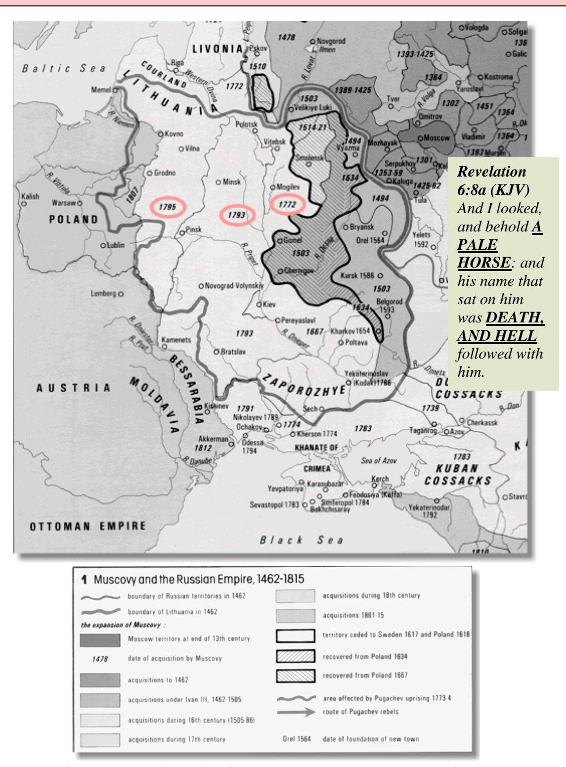
#2122 The Yom Kippur War and the Abomination of Desolation – The post-World War II U.S. waxing great Page 2 of 3 toward the South and toward the East as a second Syria/Antiochus IV Epiphanes, part 381, The History of the Pale of Settlement, (viii), In the Three Partitions of Poland, Russia essentially took the land of Old Lithuania

The detailed map below illustrates the growth of the Russian Empire. Note the acquisition of land by Russia through the three partitions of Poland in <u>1772</u>, <u>1793</u>, and <u>1795</u>. This was primarily the Lithuanian part of the Polish-Lithuanian Empire. This is also the land that Russia would designate as the Pale of Settlement.