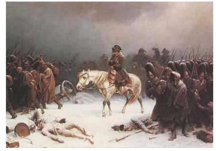
Napoleon's retreat from Moscow by Adolph Northen in the 19<sup>th</sup> century

Napoleon's Grand Army, including a substantial contingent of Polish troops, set out with the intention of bringing the Russian Empire to its knees, but his military ambitions were frustrated by a combination of the Russians and an appalling winter climate; few returned from the march on Moscow. The failed campaign against Russia proved to be a major turning point in Napoleon's fortunes.