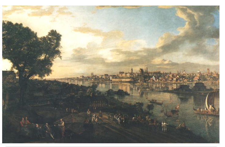
View of Warsaw from the Praga Bank painted by Bernardo Bellotto (Canaletto) in 1770. Praga was a small settlement located on the east bank of the Vistula River.

annexed by the Kingdom of Prussia to become the capital of the province of South Prussia. Liberated by Napoleon's army in 1807, Warsaw was made the capital of the newly created Duchy of Warsaw. Following the Congress of Vienna of 1815, Warsaw became the centre of Congress Poland, a constitutional monarchy under a personal union with Imperial Russia. Following the repeated violations of the Polish constitution by the Russians, the 1830 November uprising broke out. However, the Polish-Russian war of 1831 ended in the uprising's defeat and in the curtailment of the