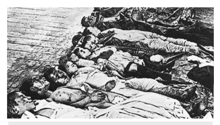
Victims, mostly children, of one of the pogroms in Ekaterinoslav in 1905. The map below shows the location of Ekaterinoslav in the Pale of Settlement.

Key Understanding: The 1903-1906 anti-Jewish pogroms in the Russian-controlled Pale of Settlement. A much bloodier wave of pogroms against Russian Jews broke out in 1903-1906. The Kishinev pogrom of 1903 was followed by a second pogrom on October 19-20, 1905, that became instrumental in convincing tens of thousands of Russian Jews to leave to the West and, eventually, in some cases to the land of Israel. It was a rallying point for early Zionists.