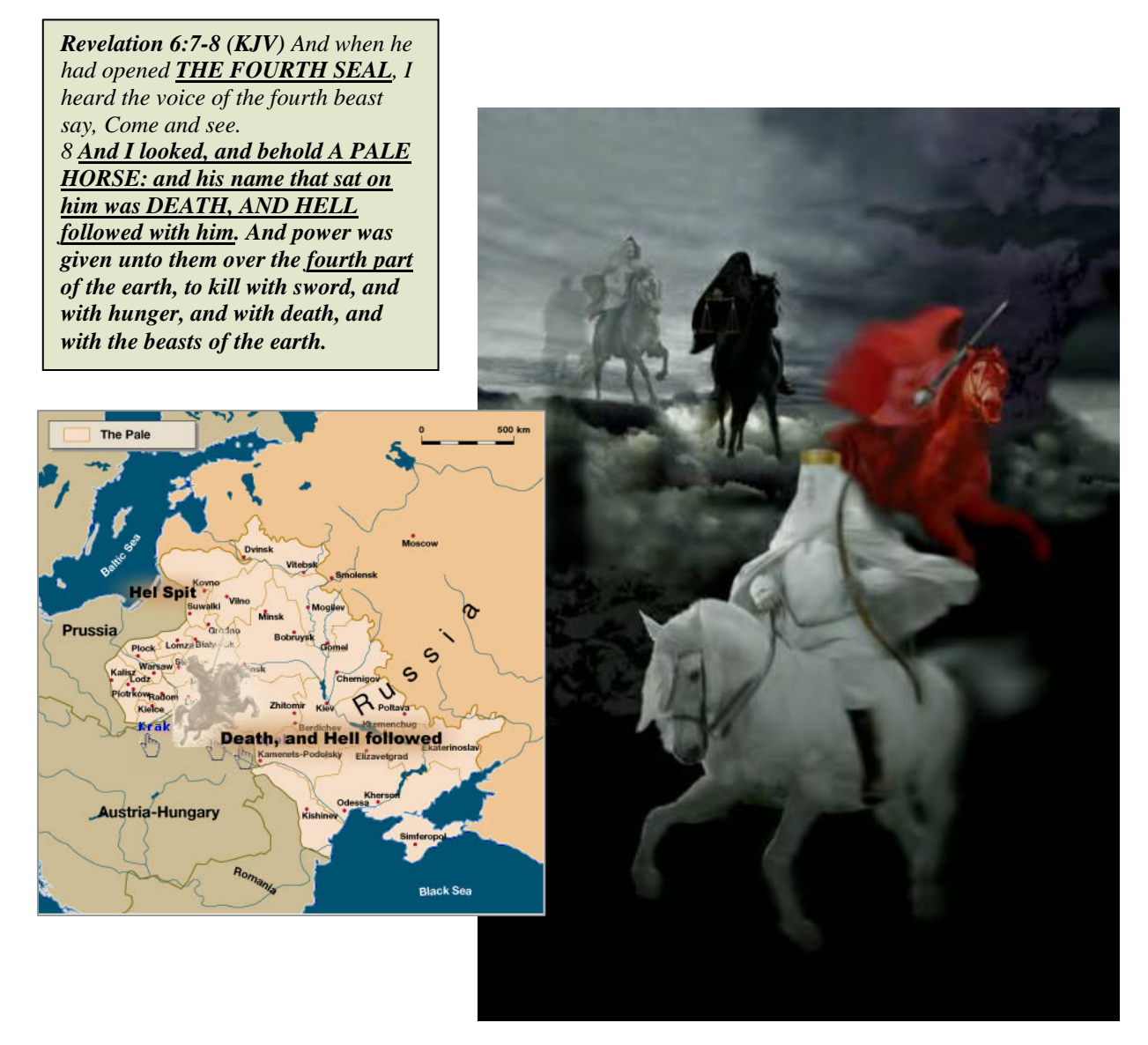
#2145 The Yom Kippur War and the Abomination of Desolation – The post-World War II U.S. waxing great Page 1 of 3 toward the South and toward the East as a second Syria/Antiochus IV Epiphanes, part 404, The Pale Horse, (i), The Pale Horse and its rider of Death, with Hell following, arose in conjunction with the White Horse, the Black Horse, and the Red Horse, closely linked with World War I

Key Understanding: The Pale Horse arises in conjunction with the White Horse, the Black Horse, and the Red Horse. Upcoming Unsealings will be for the purpose of understanding that the Pale Horse and its rider arose amidst the rise of the White Horse, the Black Horse, and the Red Horse, closely linked with World War I.