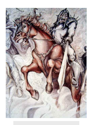
Red Horse Rider

Revelation 6:3-4 (KJV) And when he had opened <u>THE</u> <u>SECOND SEAL</u>, I heard the second beast say, Come and see.