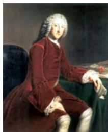
William Pitt, born in 1708

The Lord ordained that America’s ascension out of Pitt’s England would be integrally associated with Pitt , who was born in 1708 , for the purpose of verifying and clarifying that America is the Beast in Revelation 17:08 that is arising out of the pit.