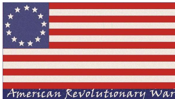
American Revolutionary War

[See Unsealing #1. William Pitt the Elder, born in 1708, was the chief “organizer of victory” and British Empire builder during the Seven Years’ War between Britain and France. Britain’s victory over France led to the birth of the United States, for its by-product was the Stamp Act of