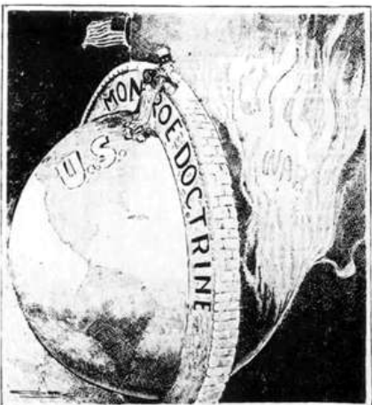
"The Great Wall," 1914 The Monroe Doctrine is depicted as a protective shield